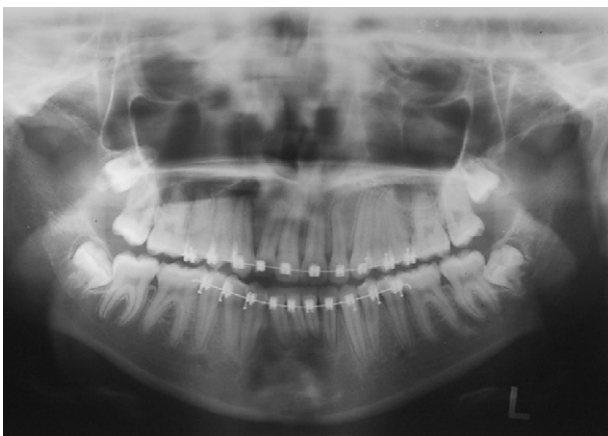
Fig. 7 – Panoramic radiograph after a 4-year follow-up. There were no findings of recurrency.

This rarity of occurrence of radicular cyst in deciduous teeth was declined by Mass et al. 3 which analyzed 49 primary molars with radiolucent lesions. 73.5% of the lesions were diagnosed as radicular cysts, and 26.5% as granulomas. The authors reinforced that radicular cysts associated