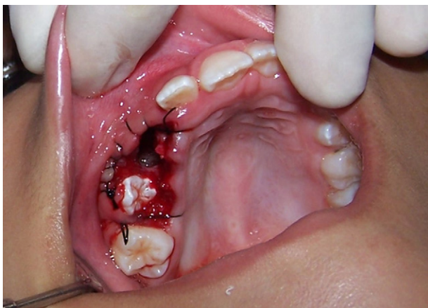
Fig. 4 – Intraoral aspect after marsupialization technique.

Benn and Altini 10 performed a clinicopathologic study of fifteen cases classified as dentigerous cysts of inflammatory origin based on clinical, radiographic and microscopic findings. The microscopic findings showed extended parts of cystic wall lined by a 2-3 cell layer thick cuboidal epithelium similar to reduced enamel. This epithelium fused with hyperplastic nonkeratinized stratified squamous epithelium of variable thickness, sometimes with anastomosing rete pegs. Many cases were lined entirely by this hyperplastic epithelium and could not be differentiated from radicular cysts. The authors defended the hypothesis that formation of dentigerous cysts occurred as a result of chronic inflammatory exudate from nonvital primary teeth that caused separation of reduced