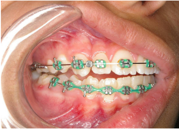
Fig. 6 – Clinical view demonstrating that the involved permanent teeth were preserved and maintained in an esthetic and functional occlusal relationship after a 4-year follow-up.

enamel epithelium in the unerupted teeth. Even so, the article regards the possibility that radicular cysts developed at the apices of the nonvital deciduous teeth enlarged and merged with the follicle of unerupted successors.