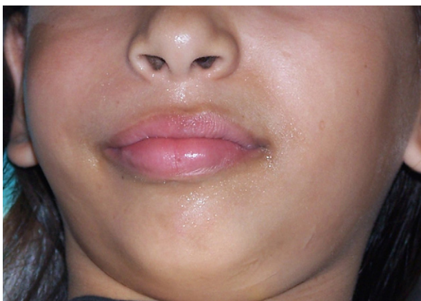
Fig. 1 – Extraoral aspect showing very slight facial asymmetry.

A 10-year-old girl was referred to our out-patient clinic with an eight-month history of painless swelling in the right side of the maxilla. The patient's medical history was noncontributory. Extraoral examination showed slight facial asymmetry (Fig. 1). The intraoral examination revealed a bluish swelling in right primary molars region and tilting of the right permanent