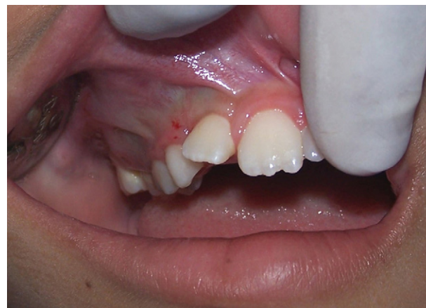
Fig. 2 – Intraoral photograph revealing a bluish swelling in right primary molar region and tilting of the right permanent lateral incisor.

lateral incisor (Fig. 2). Exploratory puncture-aspiration produced a bloody liquid. The first and second primary molars (54 and 55) were restored with amalgam fillings. The pulp vitality test was negative in 54.